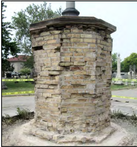
Removal of the veneer panels revealed a structurally compromised substrate, with crumbling brick and mortar throughout. A complete rebuild, requiring mostly new bricks, is needed.