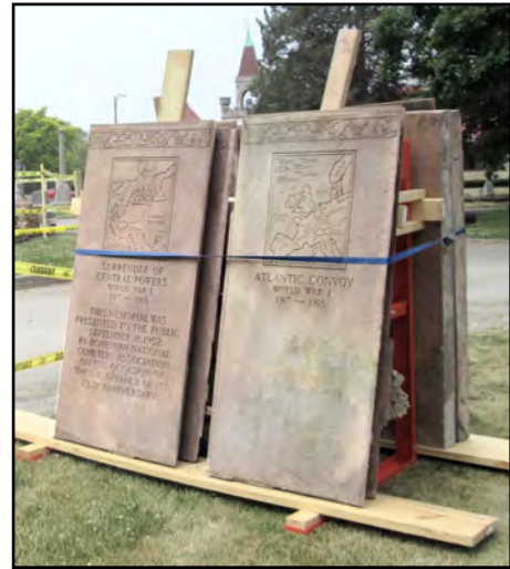
The eight unique sandstone panels are being stored on a supporting A-frame. They will be reinstalled after rebuilding and repairing the monument's brick interior and below-ground foundation.