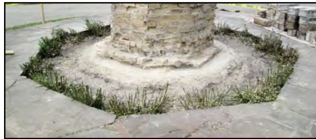
Removal of the stone ledge at the monument base exposed the severe deterioration of the concrete foundation.