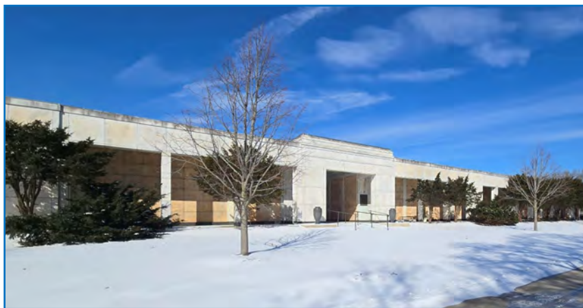
The Quiet Beauty of Winter The Masaryk Memorial Mausoleum was dedicated on Memorial Day 1960.