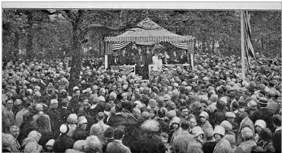
Scene of the Memorial Day Service in the 50th Anniversary Year of 1927.

For many of us, a journey to Bohemian National Cemetery involves remembering a dear family member or a fond acquaintance. We might also pause to gaze at some of the remarkable old tombstones that remind us of visits long ago with our parents and grandparents. But