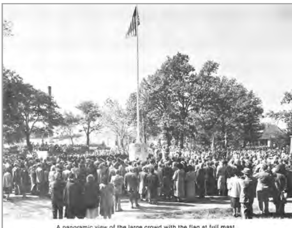
A panoramic view of the large crowd with the flag at full mast.

Chuck Michalek Friends of BNC Volunteer Wednesday Volunteer